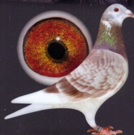
Bratt | BE 15-4264262

Mother is Olympic Rosita, top hen 1. Olympiad acebird Nitra 2012 1. prov. / 4. Nat. acebird KBDB 2012 speed