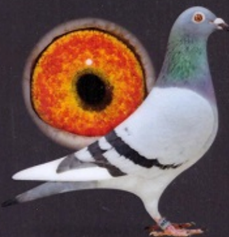
Sofie | BE 15-4100248

Mother is Olympic Rosita, top hen 1. Olympiad acebird Nitra 2012 1. prov. / 4. Nat. acebird KBDB 2012 speed