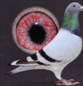
Skittel | BE 15-4264387

Kittel is super winner of 1. Nat. acebird KBDB speed 2013 Best KBDB speed cock in history 1. Quivrain 2,089 b. 1. Quivrain 1,792 b. 2. Quivrain 2,023 b.