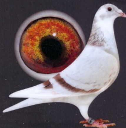
Gold Dust | BE 15-4264261

Mother is Olympic Rosita, top hen 1. Olympiad acebird Nitra 2012 1. prov. / 4. Nat. acebird KBDB 2012 speed