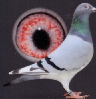
Sancy | BE 15-4264294