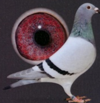
Syrah | BE 15-4264285