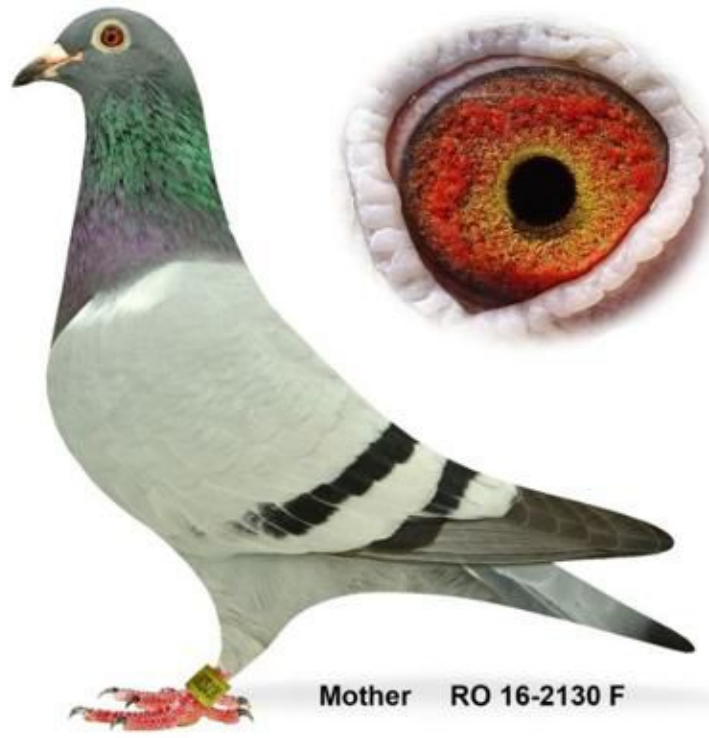
Mother RO 16-2130 F