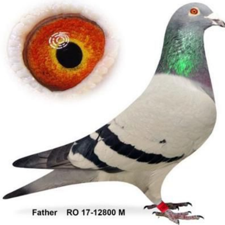
Father RO 17-12800 M